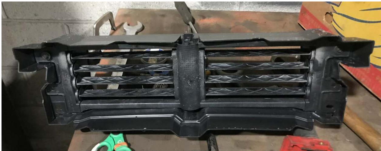
Louvers and Housing Removed From Truck