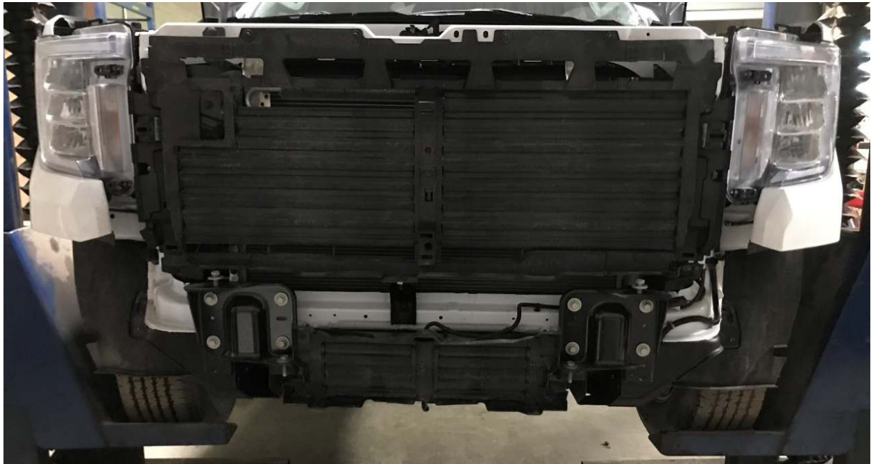
Bumper, Brackets etc. Removed From Truck