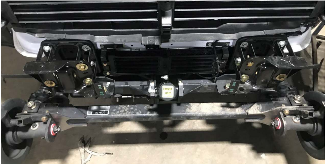
Bumper Extensions Installed