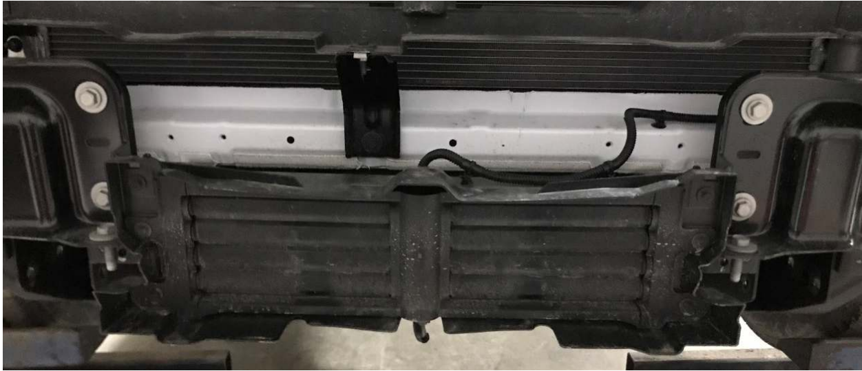
Location of 6mm Tapped Holes