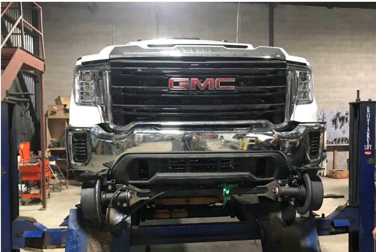
Bumper on Truck